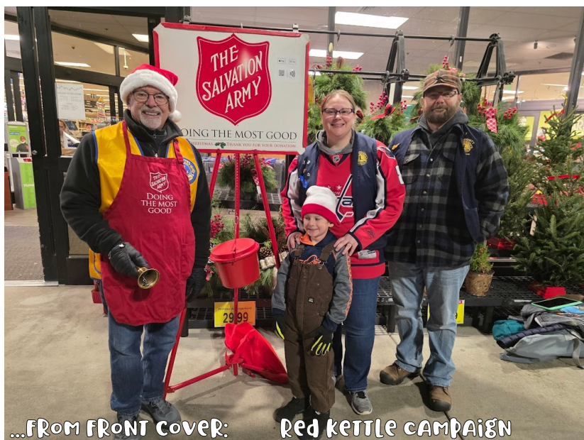
...FROM FRONT COVER: Red Kettle Campaign

Thanks to the many Lions who got out on a cold December 6 to ring the bells! Thanks for the generosity of the community that filled the kettle! The Christmas season was a little brighter for lots of area families.